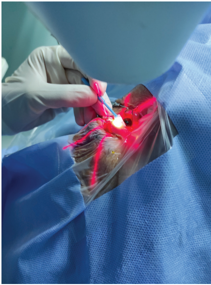
Figure 3. Accelerated conjunctival collagen cross-linking treatment utilizing the CRS-X cross-linker (Yuratek, Türkiye). A sponge was employed to safeguard the cornea during the procedure