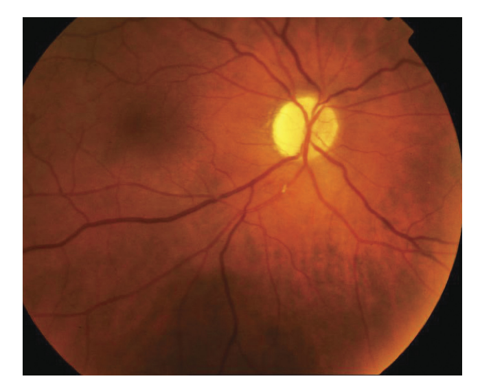
Figure 3. Color fundus photograph of the right eye with the evidence of a regressed form of an intraluminal embolus and increased caliber of arterioles, three months after transluminal Nd:YAG embolysis

Recently, Opremcak and Benner5 used the Nd:YAG laser to perform TYE in two patients with BRAO and a cilioretinal artery occlusion. TYE resulted in disappearance of the emboli and immediate restoration of retinal blood flow. They suggested that this technique might be beneficial in eyes with RAO where an embolus is visible. Mason et al.<sup>1</sup> reported five patients with BRAO who were treated with TYE. They noted that all patients showed improvement in best-corrected visual acuity one day after TYE. Fluorescein angiography showed immediate and dramatic restoration in flow past the obstructed arteriole in all patients.